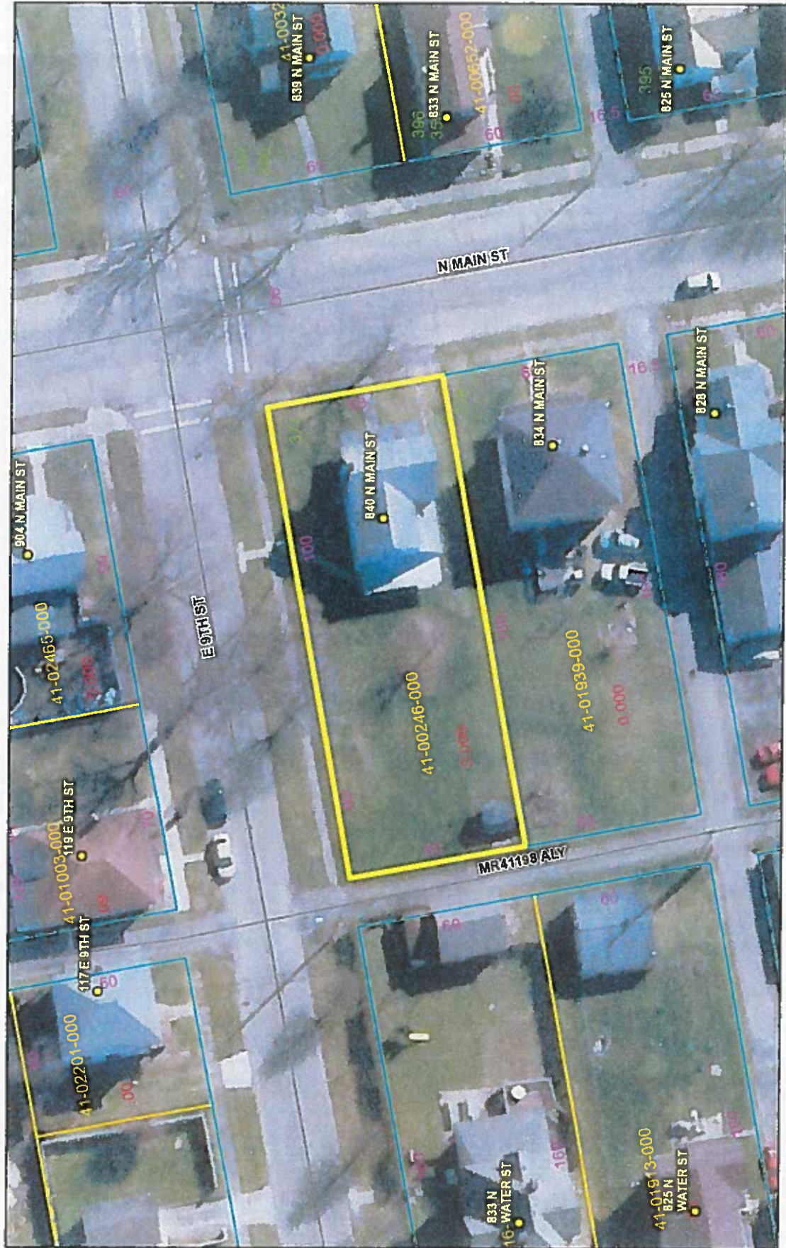
February 19, 2019